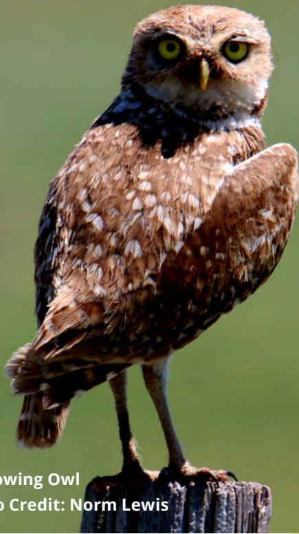
Burrowing Owl

Expanding SPLT's wildlife refuges is our top priority, to provide safe havens for the diverse wildlife and plants that make the shortgrass prairie an ecologically important and exciting place.