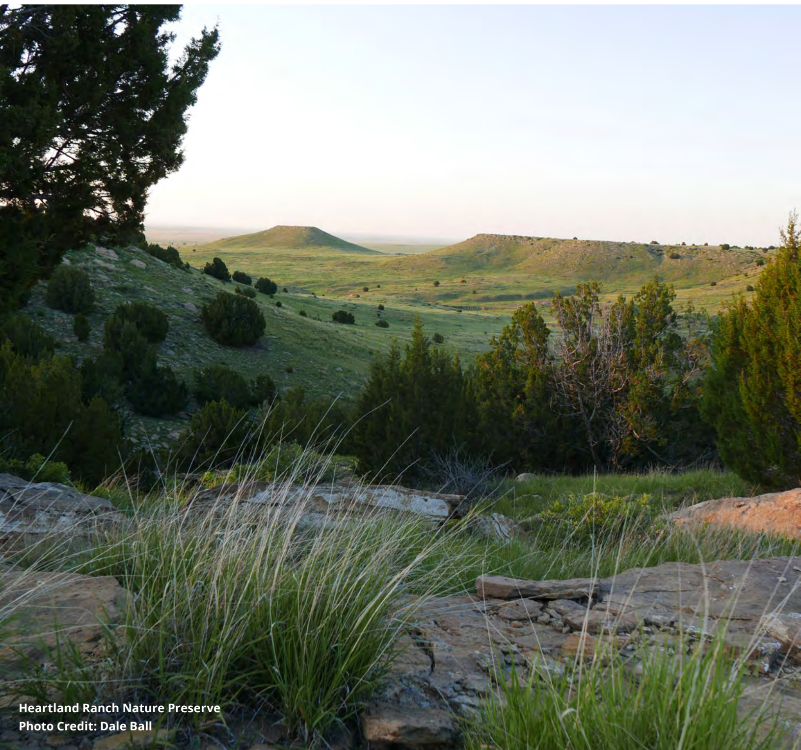
Heartland Ranch Nature Preserve

So far, we've protected over 32,000 acres in our preserve network. Piece by piece, we are restoring the American Serengeti.