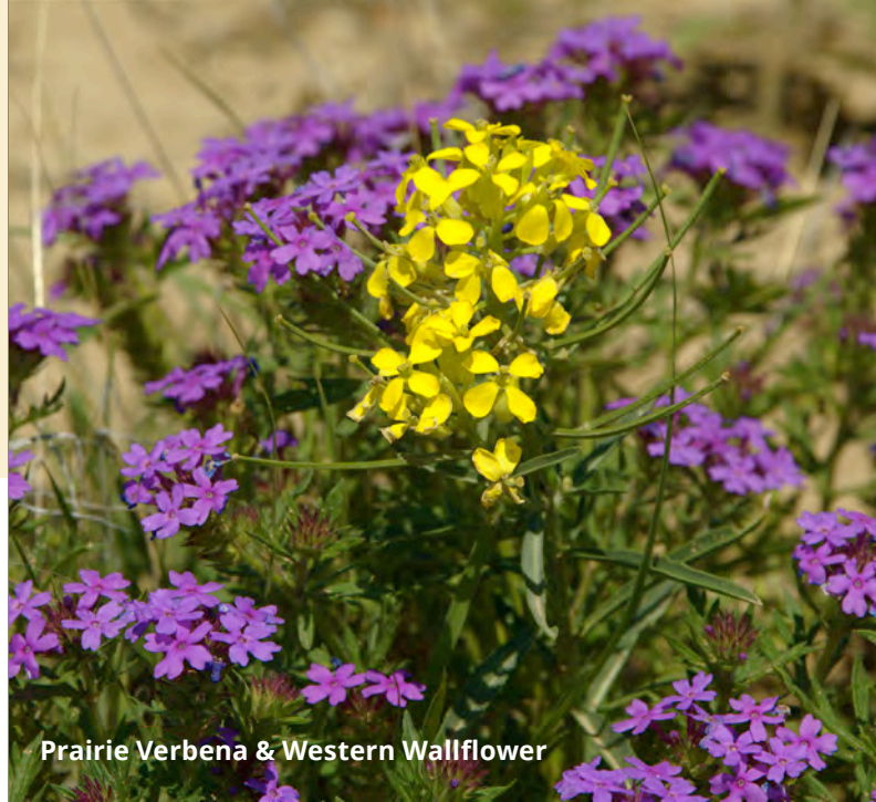
Prairie Verbena & Western Wallflower

We continue to monitor the health of our prairie dog colonies and actively work to prevent plague, which can wipe out entire