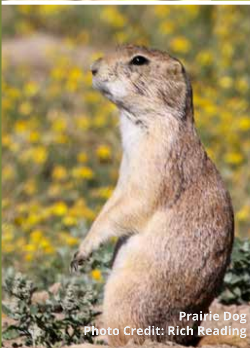
Prairie Dog