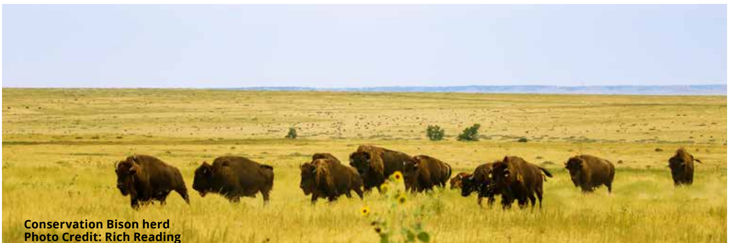
Conservation Bison herd

We are grateful to our partners that made it possible to establish SPLT's bison conservation herd. These bison were provided by Colorado State University's College of Veterinary Medicine and Biomedical Sciences. Defenders of Wildlife provided funding to help bring the bison to Heartland Ranch and have long advocated for the restoration of wild bison across their native range.