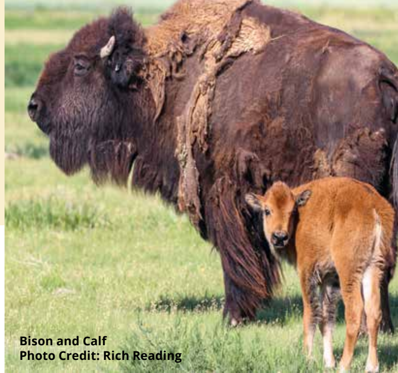
Bison and Calf

Bison are also active players in our rewilding plans. Their grazing creates a mosaic of different plant communities. They aerate the