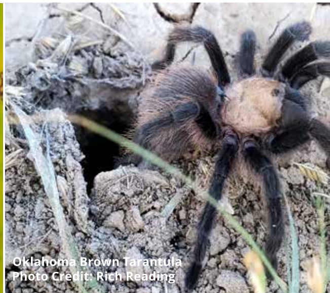
Oklahoma Brown Tarantula