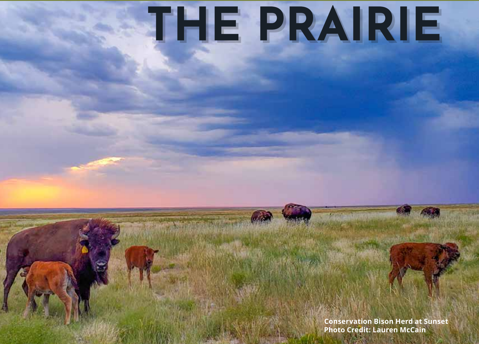
Conservation Bison Herd at Sunset