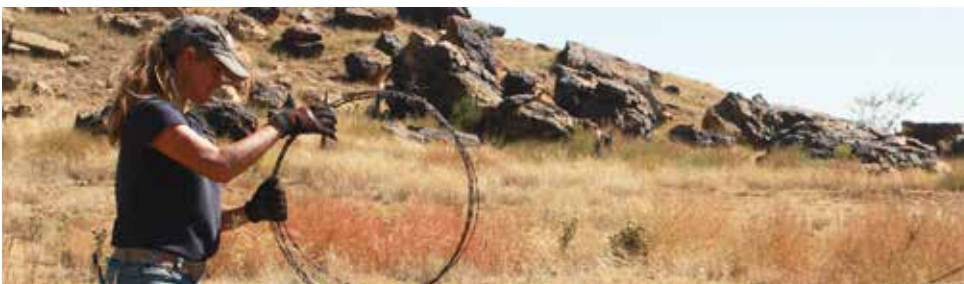
Miles of dangerous fences were removed so that wildlife can move freely across the prairie.

Rewilding also means taking out the trash and cleaning house for wildlife. People have always been part of the southern plains, and unfortunately, we tend to leave behind building materials, farming and ranching implements, and other debris. While we don't count or weigh all the trash that we remove, it happens by the truck load. We have recycled 16,140 pounds (that's over 8 tons) of scrap iron this year, and pulled out another 8 tons or more of other debris.