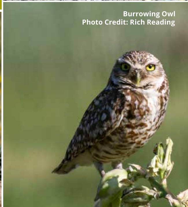
Burrowing Owl