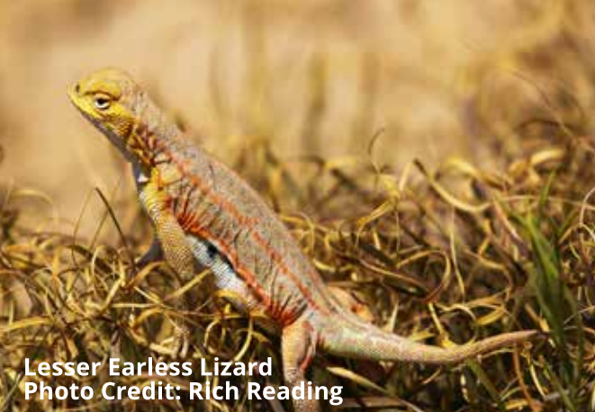
Lesser Earless Lizard

Expanding SPLT's wildlife refuges is our top priority, to provide total refuge for the diverse wildlife and plants of the shortgrass prairie.