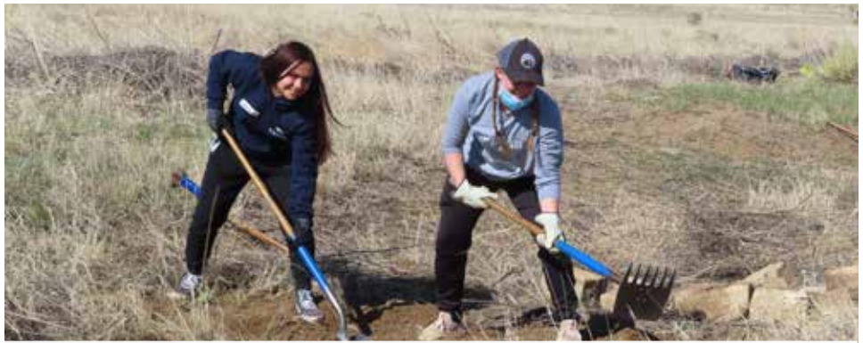
VOC volunteers in action helping to restore the prairie.

Riparian areas – the areas along streams and rivers – are important travel routes and habitat for wildlife. Lush plant cover is needed by animals to safely pause for a drink and avoid predators. Trees provide nesting and roosting sites for birds. To restore our riparian areas, we planted hundreds of cottonwood,